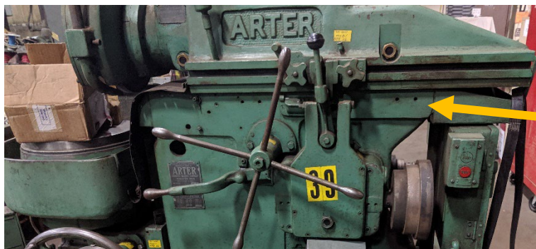
Base of Machine

The best place to find the serial number is on the nameplate. If your machine does not have a nameplate like those shown above, the serial number is stamped in the base of the machine and usually on the horizontal slide. See the photos below for locations. It may be necessary to remove some layers of paint to properly read the number.